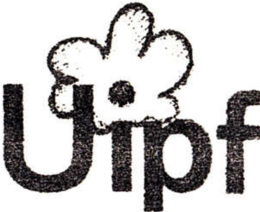
Logo of the independent initiative of Potsdam women, design: Beate Müller