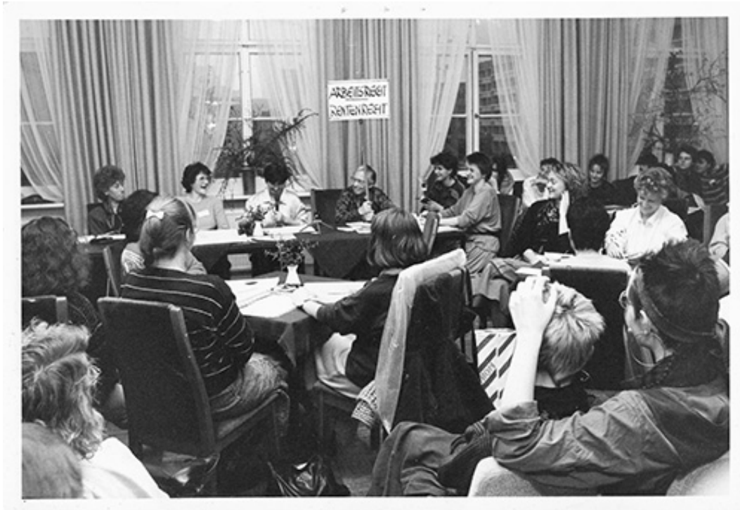
First public presentation of the independent initiative of Potsdam women in the club of artists and architects "Eduard Claudius", January 28th, 1990

Note: The press photos are available for download on our website. Please note the copyright information.