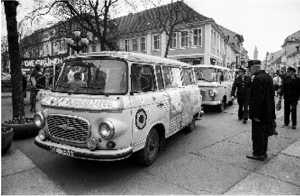
Election campaign of the Independent Women's Association and the Green Party on the occasion of the first free People's Chamber elections, March 1990