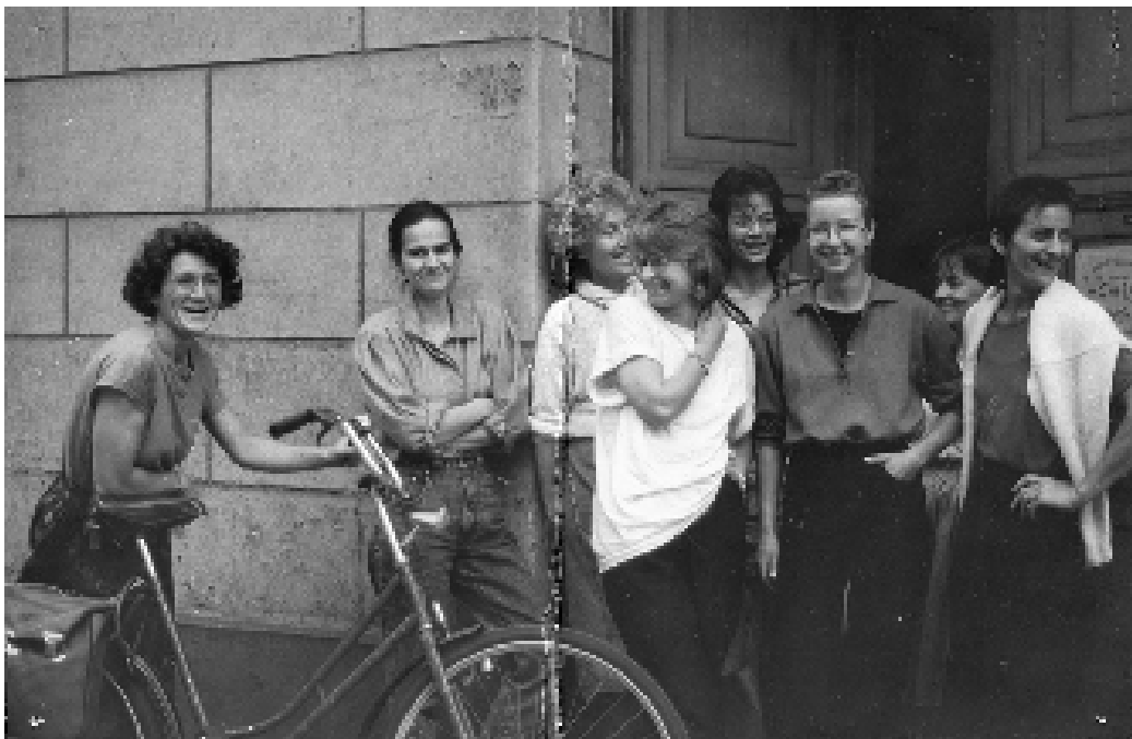
Opening of the café in the women's center, July 6th, 1990