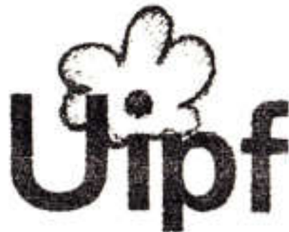
1) Opening of the café in the women's center, July 6th, 1990 2) Logo of the independent initiative of Potsdam women, design: Beate Müller

The initiative was founded in December 1989. From January 1990, together with other groups of the citizens' movement and newly founded parties, the group was based in the former Ministry for State Security (Stasi) detention center in Lindenstraße. With their commitment to legal, social and political equality for both sexes, they were involved in the development of democratic structures in Potsdam as well as in the state of Brandenburg.